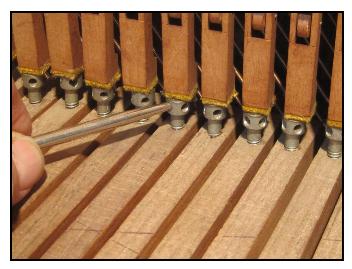
Capstans are adjusted to take up lost motion.