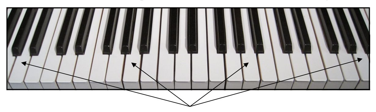
Octaves of 'A'

When a piano has been subjected to fluctuations of humidity, swelling or contraction of the soundboard will have resulted in the octaves from one end of the keyboard to the other of the piano not lining up well. This disparity in the octaves becomes obvious when both the left and the right hand are involved in the music. In such a situation, the piano will have an unbalanced, confusing sound.